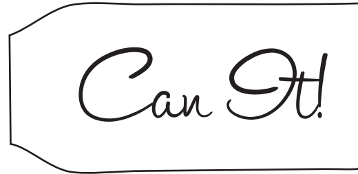
Jar Label Cut 1